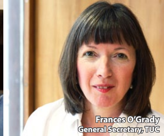
Frances O'Grady General Secretary, TUC