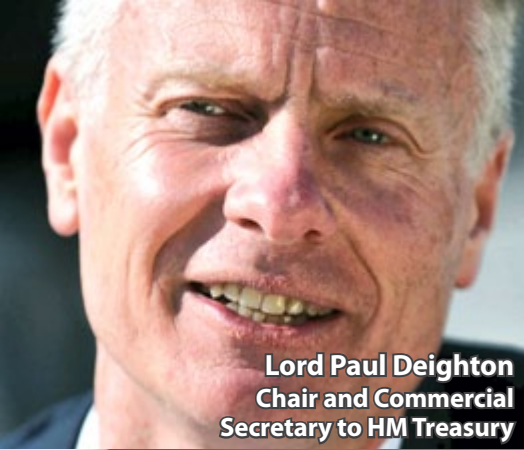
Lord Paul Deighton Chair and Commercial Secretary to HM Treasury