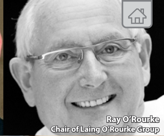
Ray O'Rourke Chair of Laing O'Rourke Group