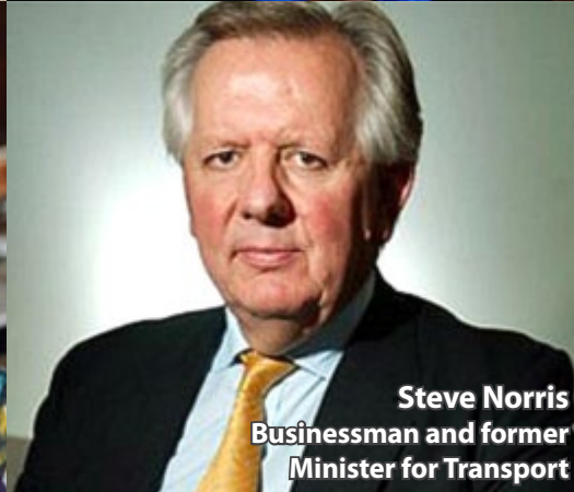
Steve Norris Businessman and former Minister for Transport