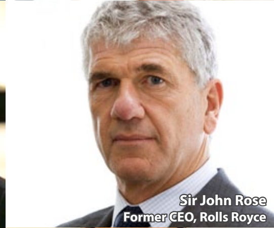
Sir John Rose Former CEO, Rolls Royce